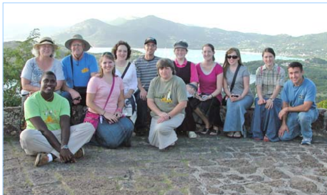
Christmas Antigua Team 2011-12