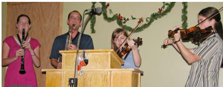
Playing a special at a Christmas service