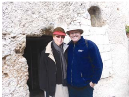
A possible site of the garden tomb