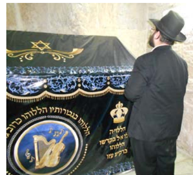
Praying at the Wailing Wall

Upcoming Teams – Let us know if you are interested or know of someone interested in one of our mission teams. It will change your life forever. Contact us at mttministries@aol.com or 864-982-3398. And visit us at mttministries.org .